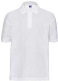
White polo shirt