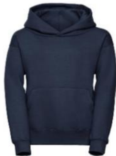
Navy hoodie and Navy joggers