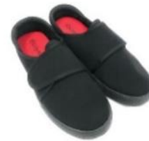
Trainers or plimsolls